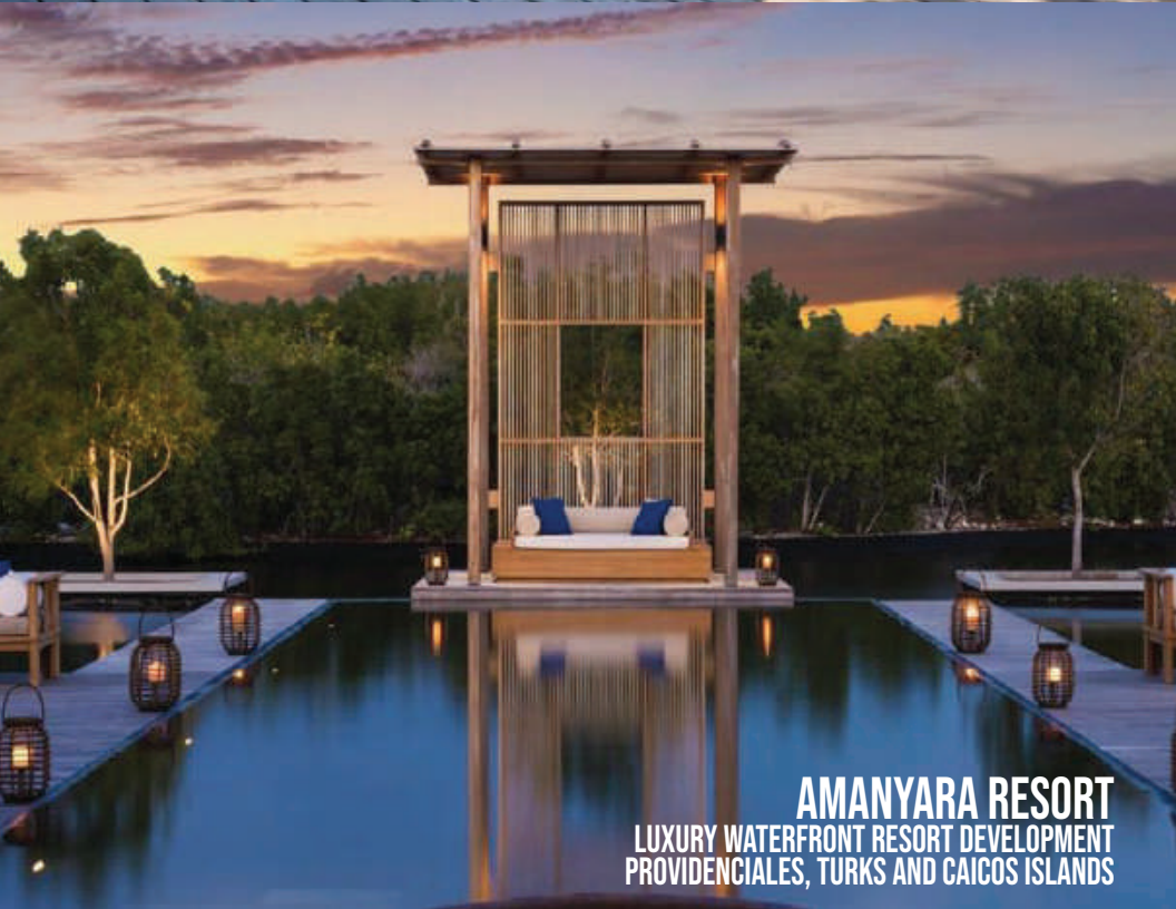
AMANYARA RESORT LUXURY WATERFRONT RESORT DEVELOPMENT PROVIDENCIALES, TURKS AND CAICOS ISLANDS